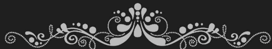
PHOTO BOOTH FUN!

Find a friend, grab a silly hat, strike a pose and have a blast.